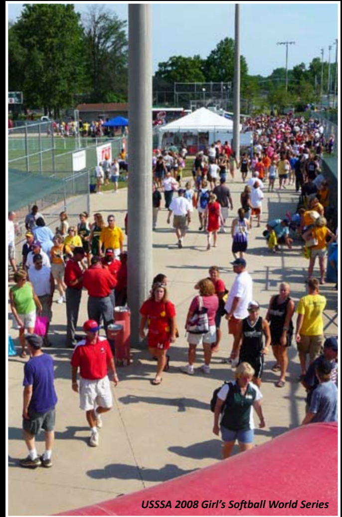
USSSA 2008 Girl's Softball World Series